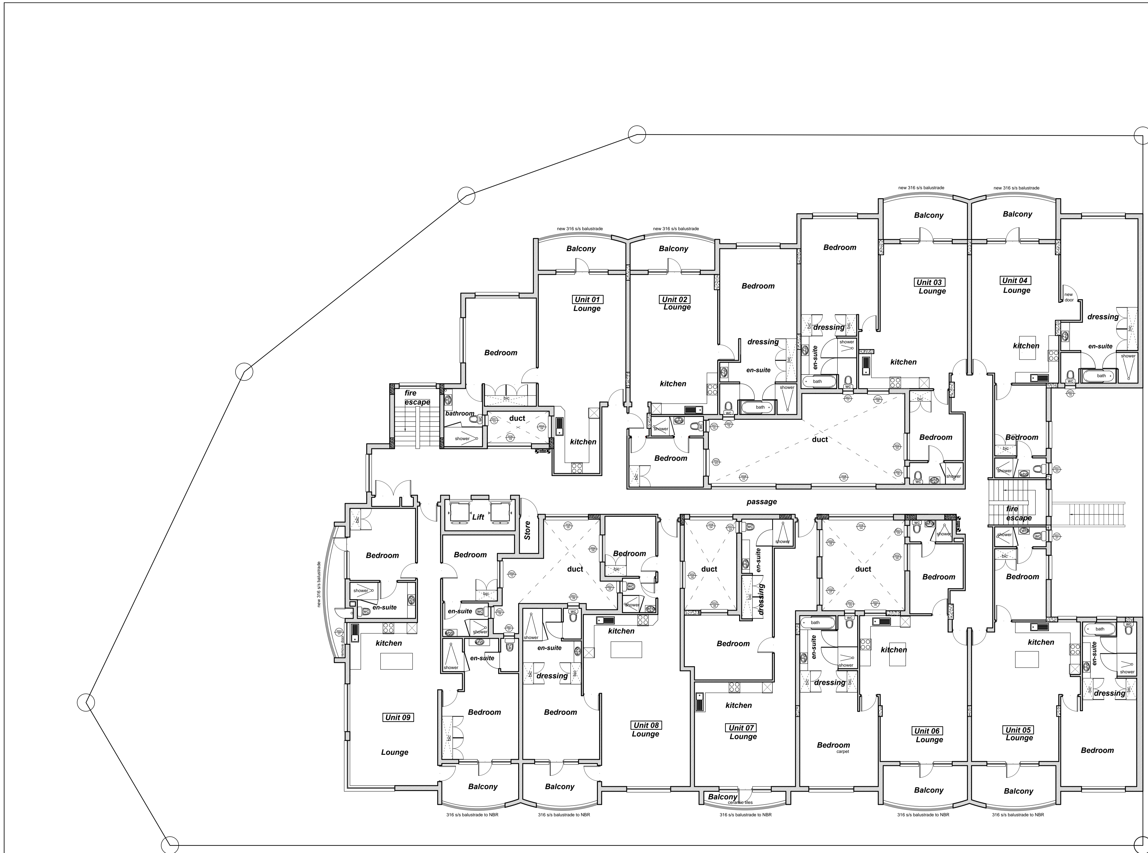
TYPICAL FLOOR PLAN SCALE 1:100